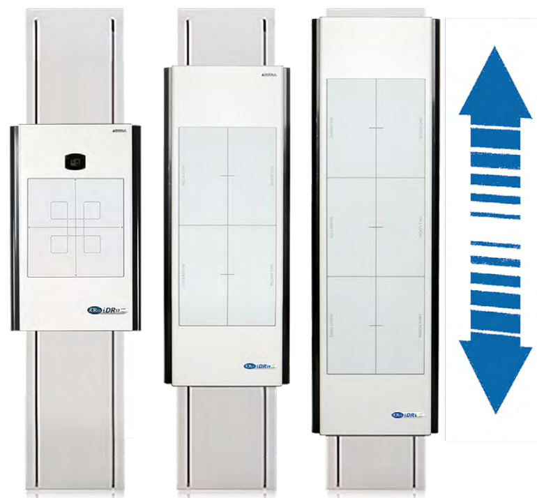
Multiple iDR Sizes Available

14" x 17" & 17" x 17" | 14" x 34" & 17" x 34" | 14" x 51" & 17" x 51"