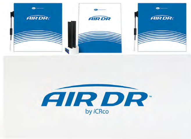
Multiple AirDR Panels Available

17" x 17" Wired (Csi) | 14" x 17" Wireless (Csi) | 17" x 17" Wired (Gos)